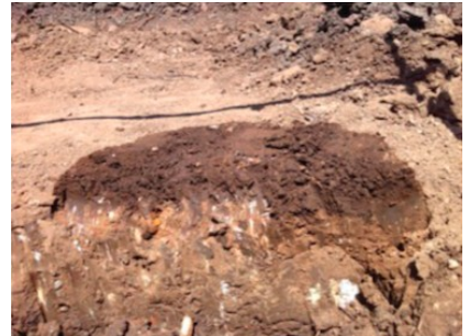
Soil cross-section after 30 minutes with a surface drip unit.

The result is seen in a 30-minute side-by-side test using identical drip emitters. DRI's technology provides superior soil saturation.