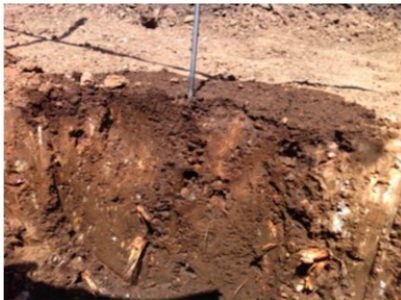
Soil cross-section after 30 minutes with a DRI-12 unit.

Patented technology ensures that water percolates up to the roots. None is lost to surface runoff or evaporation.